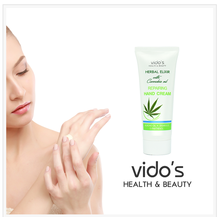
Vido's Health & Beauty USA's Repairing Hand Cream