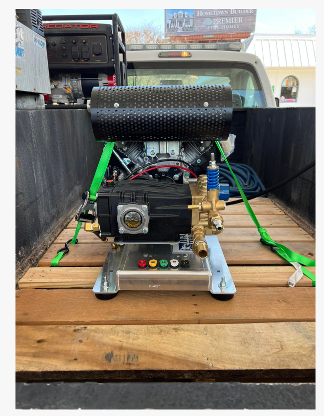
First Coast Softwash Equipment