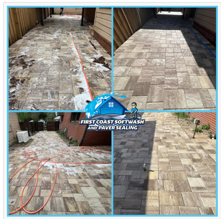
First Coast Softwash Paver Sealing

For additional learning, First Coast SoftWash & Paver Sealing has pieced together a blog discussing topics like How to Clean Your Pavers To Ensure Proper Sealing and How Often Should You Clean Your Roof. Many past clients are happy with the services. Here is one of the reviews, "Professional, thorough, attention to detail in preparing pavers for sealing. Sealed pavers look great. This was the second job they done for me."