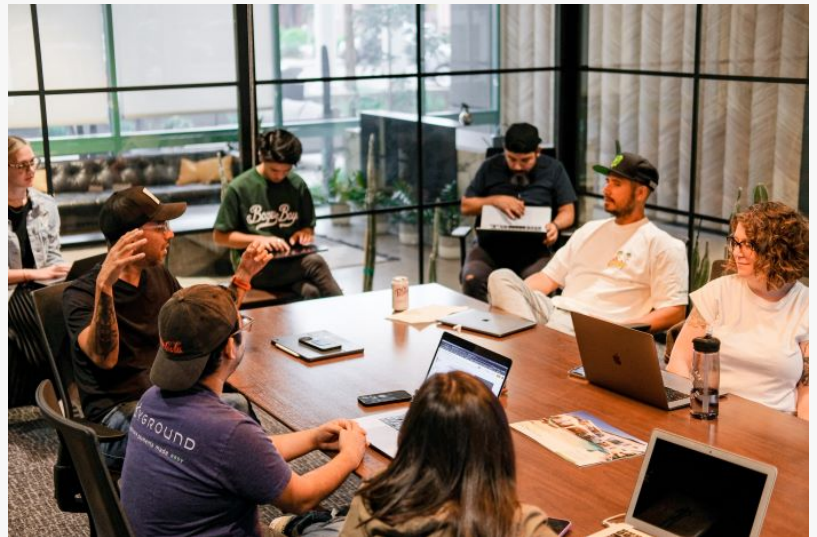
Robot Feelings team at Sandoval Agency

- Invitations to ongoing community involvement projects such as Robot