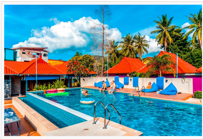
Bodega Koh Phangan Roadside

Bodega Hostels are built to inject a 100% adrenaline rush into 18 to 35 year old travelers, with properties and entertainment designed specifically around adventure, socializing, epic pub crawls and non-stop fun. When you stay at a Bodega Hostel, you become one of the tribe. Bodega is part of the Collective Hospitality portfolio, a tourism and leisure company focusing on the alternate accommodation sector, Collective Hospitality is one of the fastest growing Lifestyle brands with multiple properties owned or under contract across Asia with