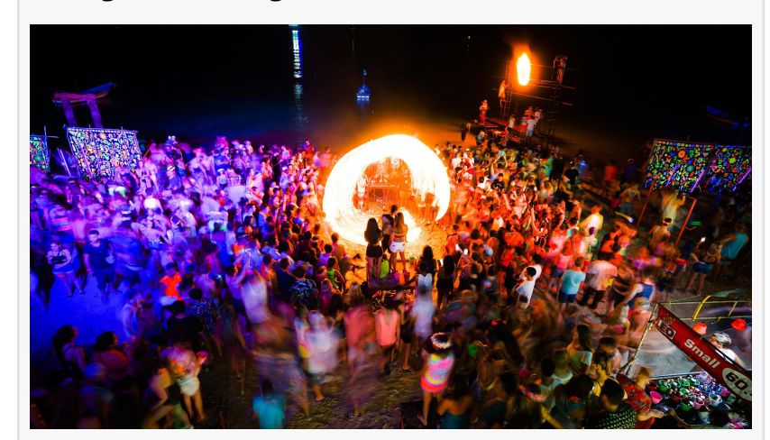
Full Moon Party - Koh Phangan

planned moves into Europe and the Americas from 2023 onwards.