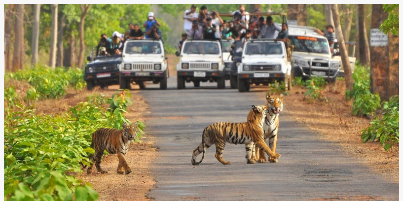
Corporate tour in Ramnagar

UTTARAKHAND, RAMNAGAR, INDIA, August 26, 2022 /EINPresswire.com/ -- Corporate events can be a huge mess if there is no proper technical setup. When you have to follow strict and hectic schedules, deadlines, and peer pressure, organizing the corporate event to develop bonding is important to encourage your team to be enthusiastic and active towards their work. However, to find a perfect venue for that, arranging things from a proper setup to decoration, activities to catering can be a bit exhausting and it even needs a lot of time. To make it function seamlessly, there is a need for someone experienced with appropriate proficiency, professionalism, and well-versed to handle the corporate events with ease. We help our guests by arranging them all material, equipment, and whatever related to Corporate Events including a Video Conferencing System, white Boards and markers, projectors, notepads, mic, music systems, and other sort of technical assistances.