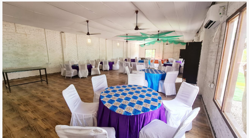
Conference hall in Jim Corbett

The team of resort will take care to handle accommodations and provide other required facilities for guests. Our team here is aware about all the technical aspects required for the successful meetings, and even in the remoteness from suburbs, we have everything to make it the best set from facilities.