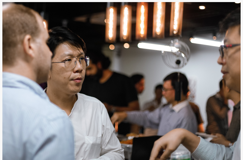
FinTech investors listen to pitches

US digital banking startups will graduate from Mbanq Labs Accelerator program