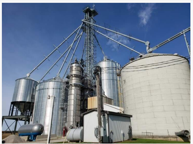
Talbot Elevators, Aylmer, Ontario

/EINPresswire.com/ -- As we look ahead to another fall harvest, Grain Discovery is looking back at the early adopters of its ground-breaking digital grain ecosystem and the incredible impact the technology has made to their day-to-day operations.