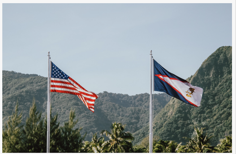
American Samoa Flags

https://llc.as.gov . These articles contain information like business address, name of the owners, limited liability statement, management information, and seed contributions by the members.