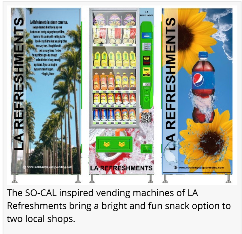
The SO-CAL inspired vending machines of LA Refreshments bring a bright and fun snack option to two local shops.