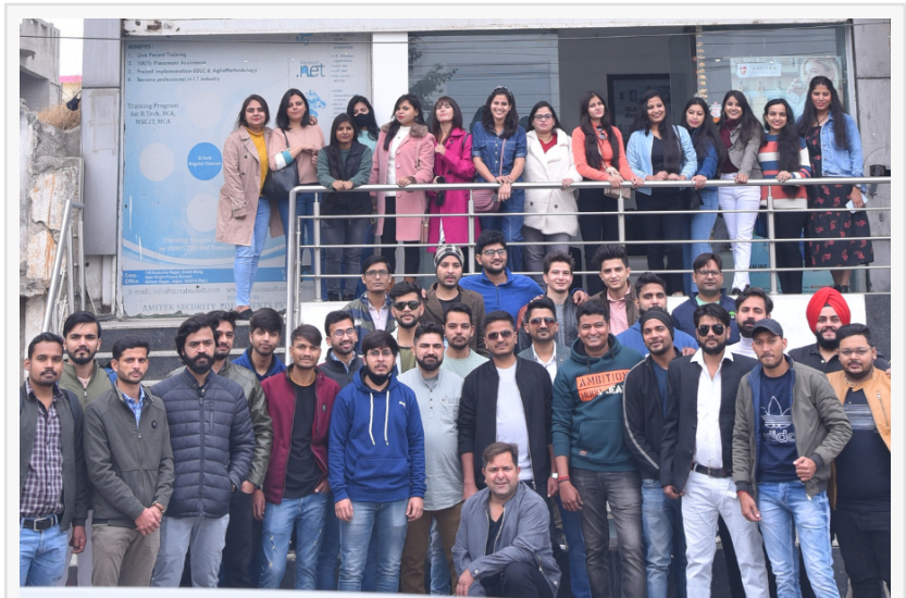
Software Development Team

It is the commitment and flexibility that Decipher Zone's developers are ready to give to ensure the growth of their clients by delivering high-quality products to drive high revenue for the client's business.