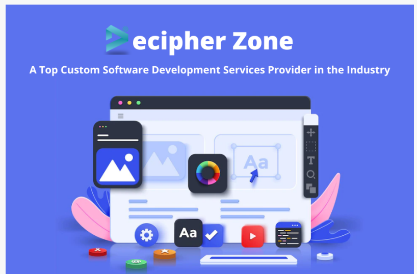
Custom Software Development