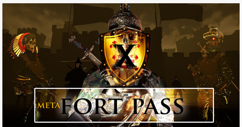
The X NFT MetaFort Pass

In addition to commanders, there will be 6,500 Generative Legionnaires that will have a range of rare and ultra-rare traits of one of the nine legendary commanders. Delivering a truly matchless Triple A studio quality art that mashes up past, present, and future weapons, gear, and storytelling.