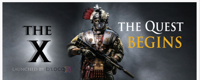
The X NFT

SAINT PETERSBURG, FL, USA, August 29, 2022 /EINPresswire.com/ -- BlocqX announced today that they have been in development since Jan 2022 to produce and launch a new NFT collection and future gaming experience with a dedicated and fully interoperable metaverse.