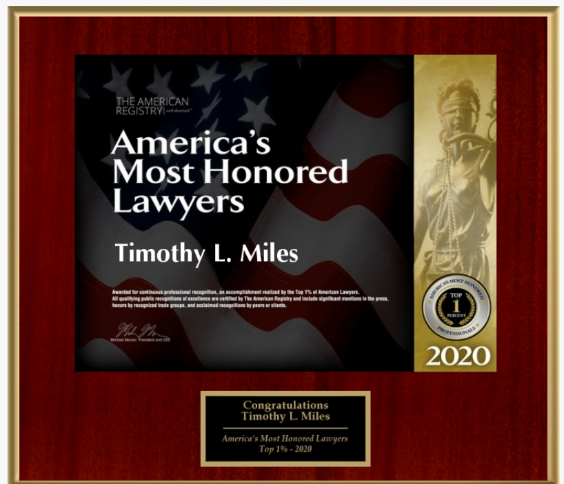
Nationally Recognized Shareholder Rights Attorney Timothy L. Miles Has Achieved the Recognition of American's Most Honored Lawyers 2020 - Top 1%