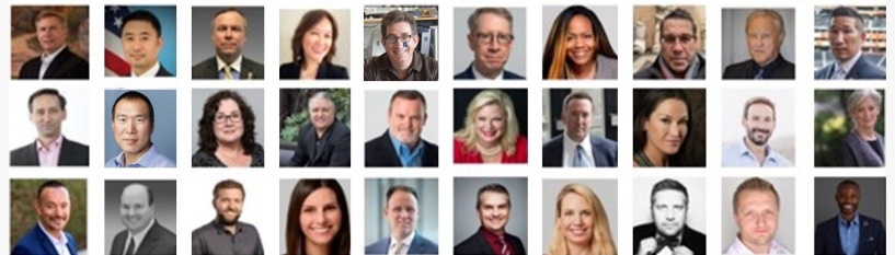
PREMIER ISSA Security Event in SoCal