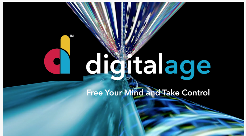
Digitalage New Logo

© 2022 Hop-on, Inc. All rights reserved. Hop-on, Inc. is a registered trademark of Hop-on, Inc. in the United States and other countries. Digitalage is a registered trademark of Hop-on, Inc. in the United States and other countries.