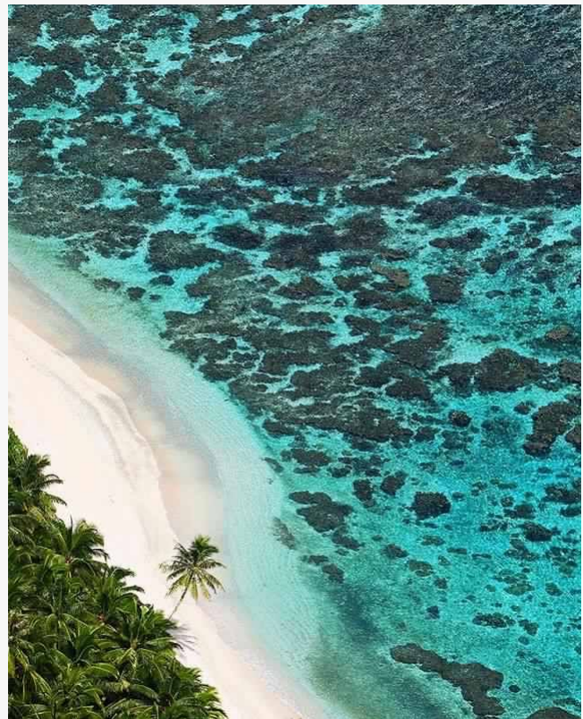
American Samoa USA