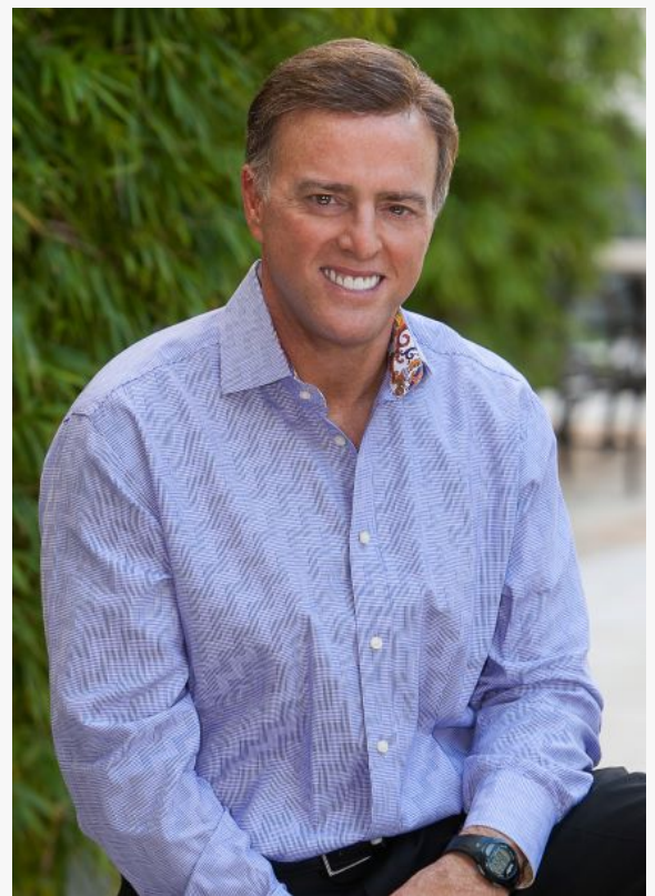
Former Congressman Ric Keller is an attorney, writer, humorist, motivational speaker and television commentator.

Chase the Bears: Little Things to Achieve Big Dreams