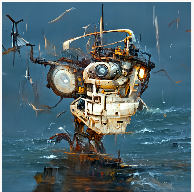
Artsy Monke 8865/10000. Oil Painting. Lost at Sea.

This press release can be viewed online at: https://www.einpresswire.com/article/588437857