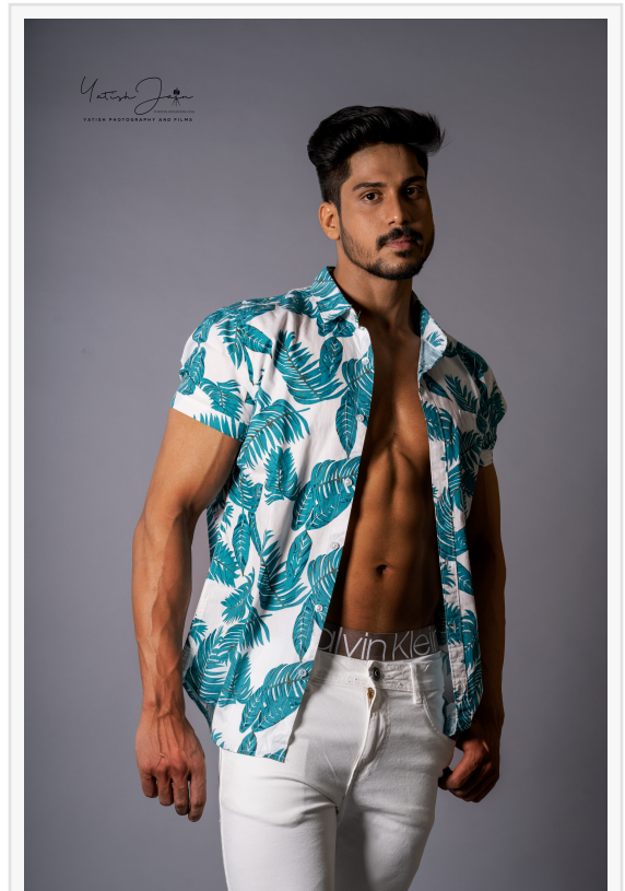
Ecommerce Photoshoot in Bangalore

"Advertising photography is now more critical than ever to a logo's photo. With commercials being shared on social media and going further than manufacturers may want to ever expect,