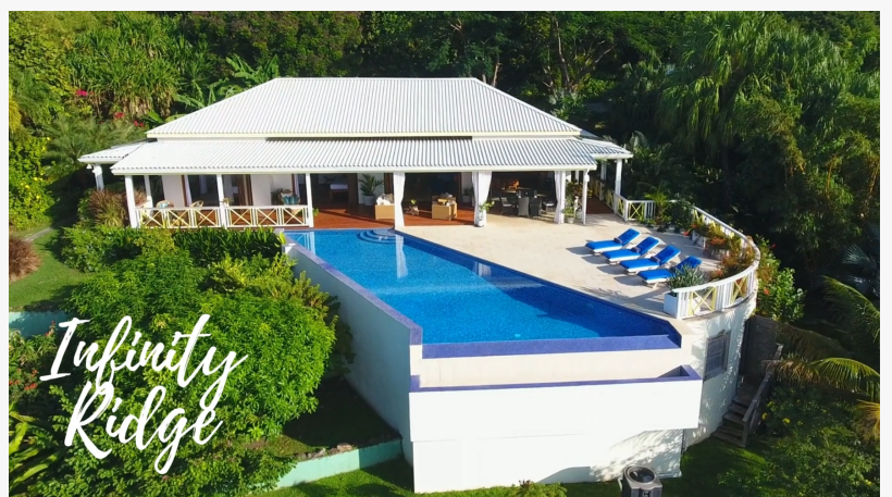
Luxury Caribbean Villa

CHARLESTOWN, NEVIS, ST. KITTS, August 31, 2022 /EINPresswire.com/ -- Anyone who has visited St Kitts and Nevis knows the islands are unique. To visit Nevis is to step back in time, to a tiny gem of an island where the wild Atlantic crashes waves into one side and the Caribbean laps softly on the other. There are no traffic lights, just one roundabout, and companions on the road are as likely to be donkeys as they are other cars.