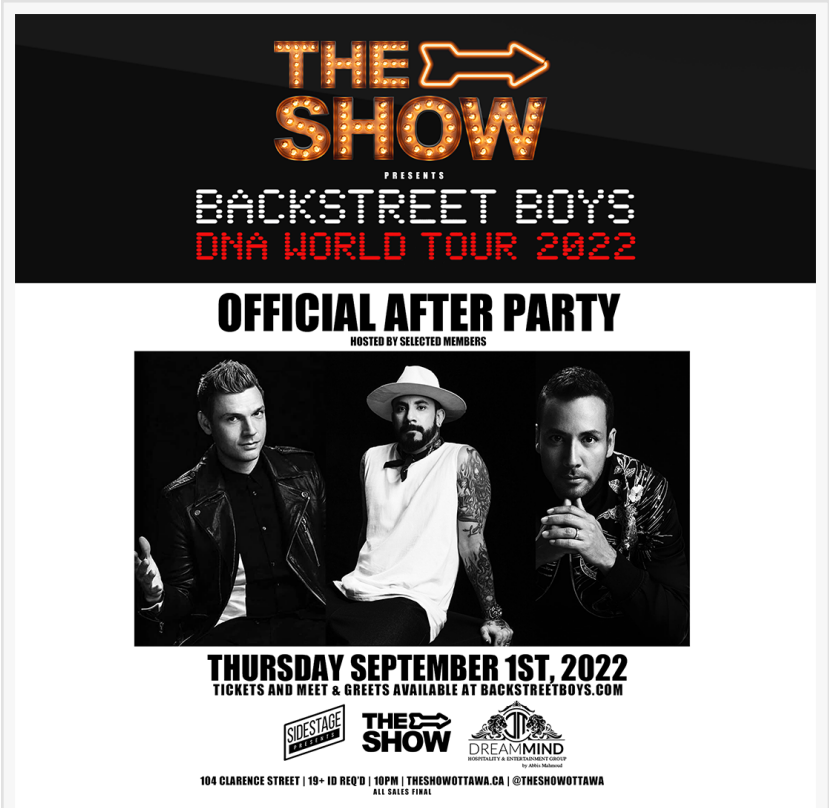
Backstreet Boys at the Show

The Dreammind Group, previously hosted Backstreet Boys twice in Ottawa and once in Toronto