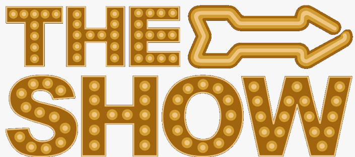
Logo of the SHOW