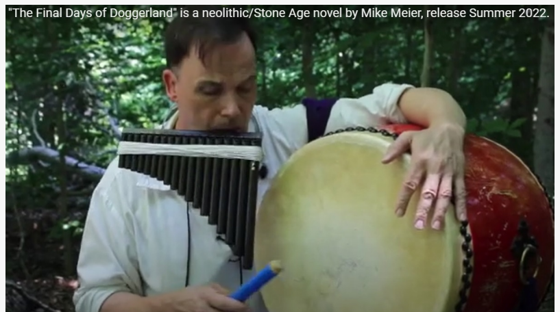
Mike Meier wrote 5 songs for the story The Final Days of Doggerland