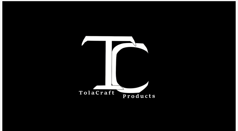
Tolacraft Products logo

This press release can be viewed online at: https://www.einpresswire.com/article/588655538