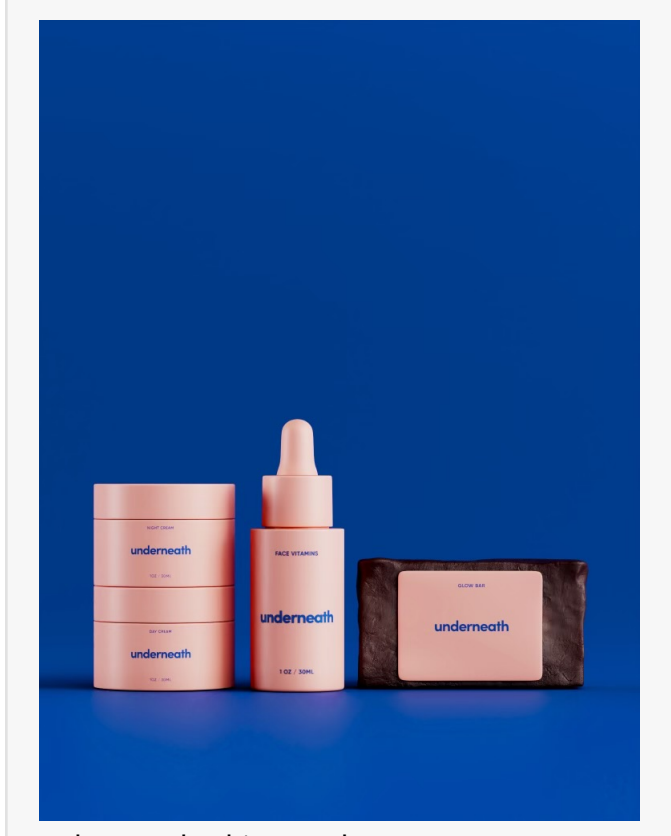
Underneath Skin Products