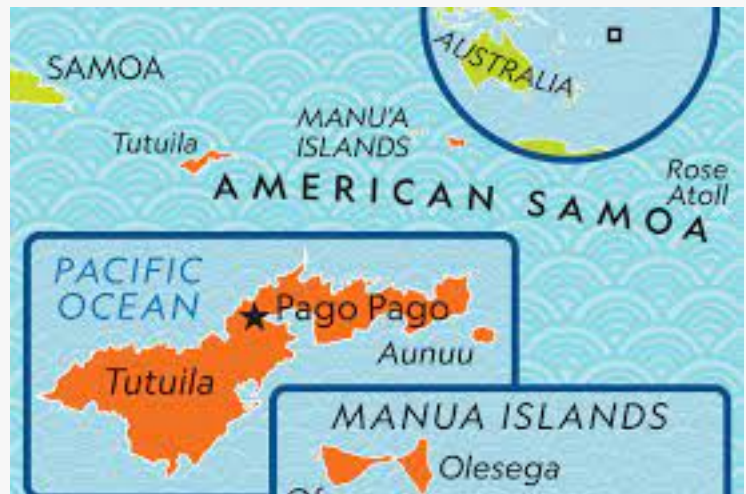
map American Samoa

Since foreigners do not need a social security number, they can opt for an ITIN or Individual Taxpayer Identification Number. The ITIN makes it possible for non-residents to get EIN or