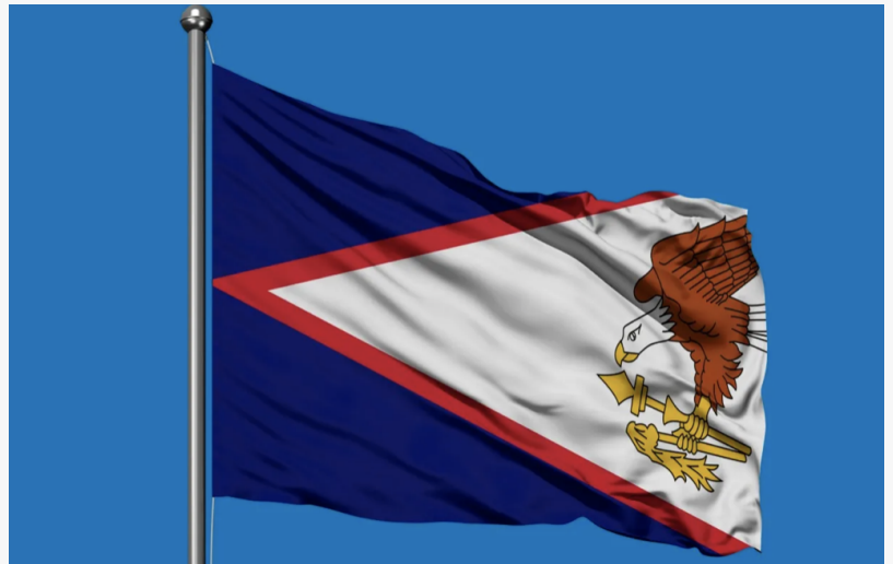
American Samoa Flag

If a business is trying to figure out which type of entity would suit a business best, know that there are different types of LLCs available. In this article, we will explain what is need to know about the differences between an anonymous and private LLC, as well as some considerations when deciding whether or not to go with an LLC or Anonymous LLC.