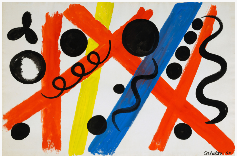
Gouache and ink on paper by Alexander Calder (American, 1898-1976), titled The Beams, 1963, 27 ¼ inches by 40 ¼ inches (est. $40,000-$60,000).