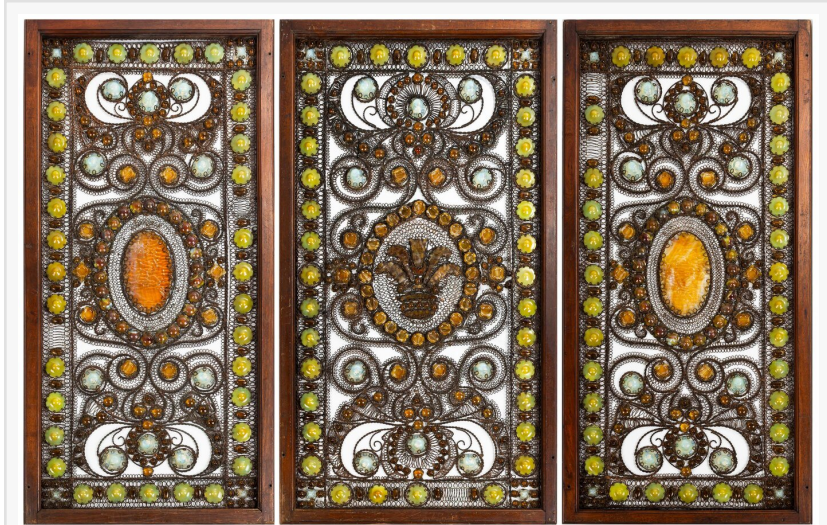
Moorish filigree screens attributed to Louis C. Tiffany Company, Associated Artists (NY, 1881-1883), jeweled glass and bronze-dust coated copper wire. Max: 51 inches by 78 inches (est. $75,000-$125,000).