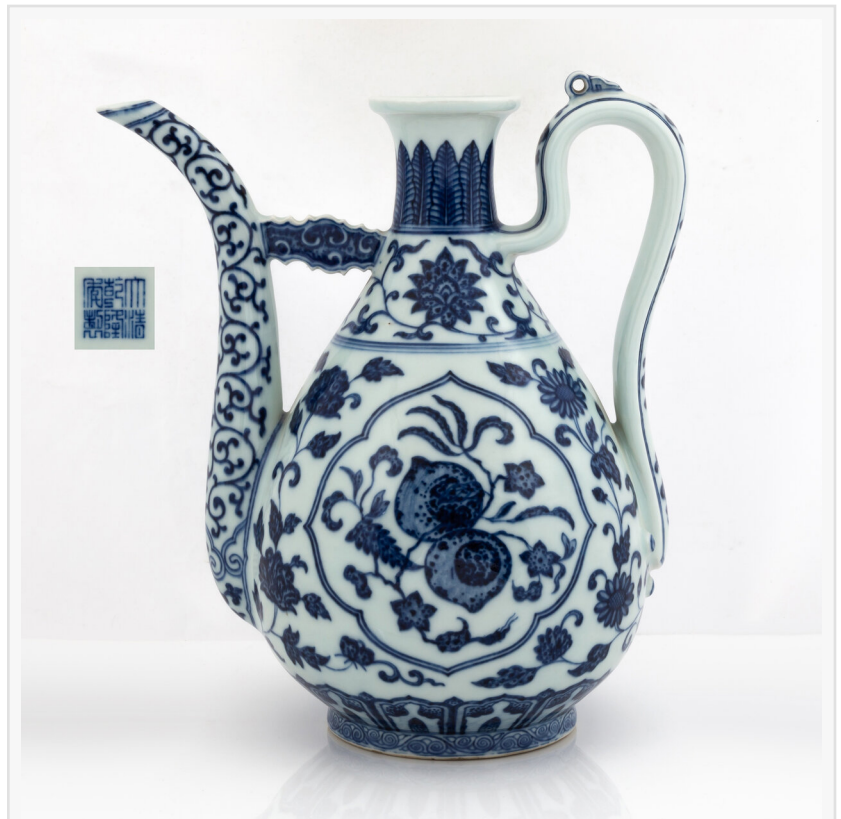
Rare Chinese Ming-style blue and white ewer, mark and period of Qianlong (1736-1795) (est. $50,000-$80,000).