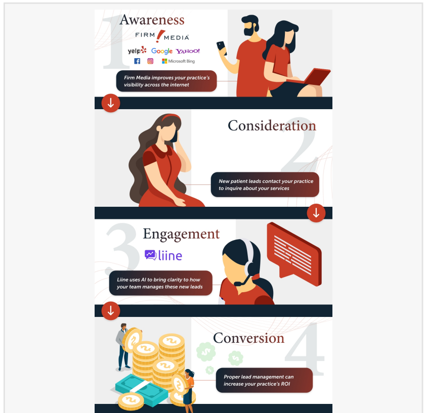
Firm Media and Liine Funnel of Patient Acquisition

With the addition of Liine into their digital marketing strategy, healthcare