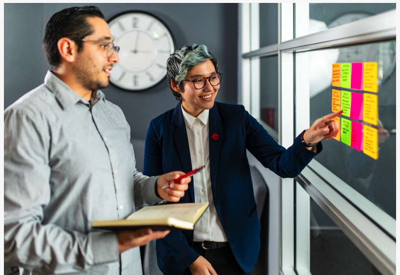
Creative Director and Design Team Collaboration