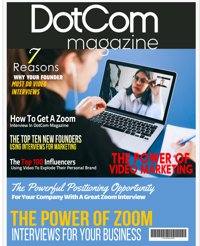
The Power Of Zoom Interview Issue