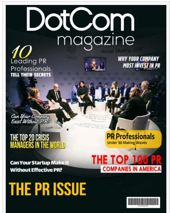
The DotCom Magazine PR Issue

DotCom Magazine is a leading news platform providing fascinating interviews with news makers, thought leaders, and entrepreneurs. DotCom Magazine is the leader in putting people with insatiable entrepreneurial spirit at the forefront of every story it covers. The Entrepreneur Spotlight Interview Video Series looks at business through the lens of a successful entrepreneur's mindset. The Entrepreneur Spotlight Series has included high-profile leaders, including Inc 500 founders, Ted Talk presenters, ABC Shark Tank participants, venture backed visionaries, prolific CEO's and Founders, and many other wonderful thought leaders and entrepreneurs. DotCom Magazine covers Founders and CEO's making a difference. Regardless of who the entrepreneur is, where they live, or what they are doing, if it is interesting and newsworthy, DotCom Magazine covers it. In selecting entrepreneurs for this important video series, we consider the newsworthiness of the