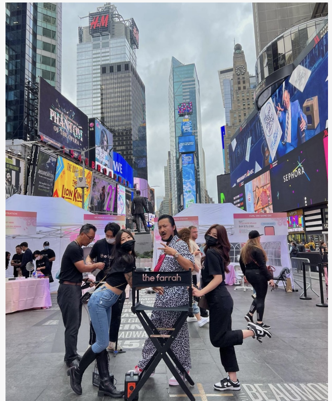
Ssoonie Style Downtown Event