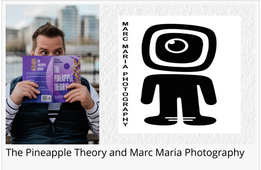
The Pineapple Theory and Marc Maria Photography

LONGUEUIL, QUEBEC, CANADA, September 4, 2022 /EINPresswire.com/ -- The purpose of The Pineapple Theory is to add a pineapple in people's life to assist humans to live on Earth more happily, together. The book and services assist defining ones' life & leadership philosophy and build or improve an inner-foundation with easy-to-use life principles acting like