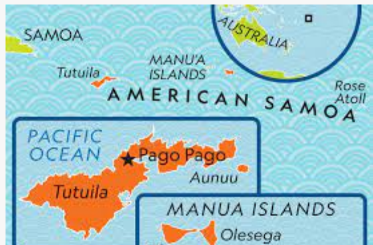
map American Samoa