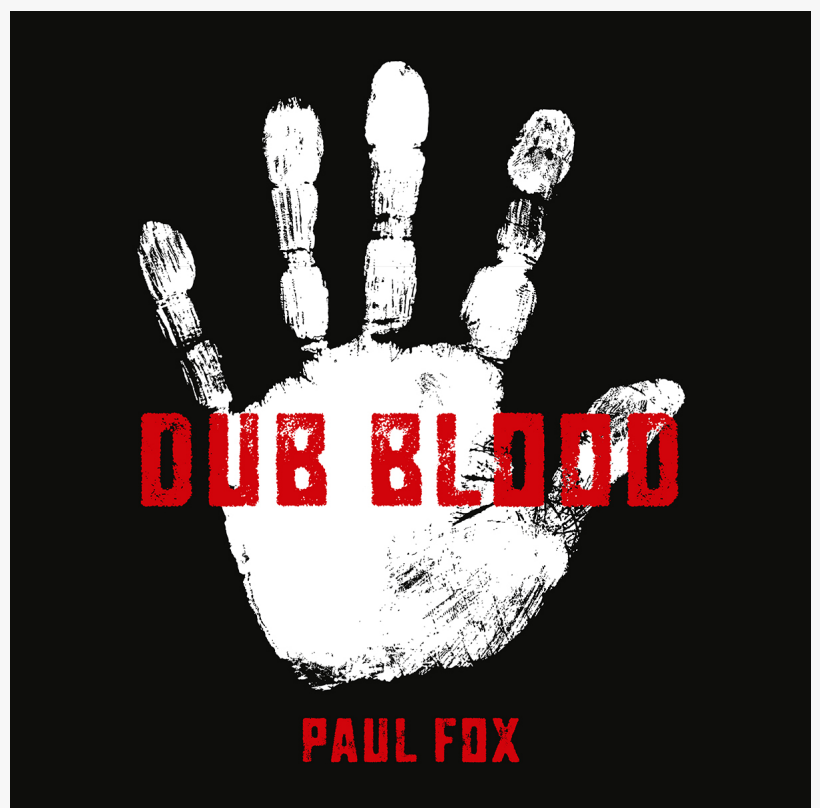
Paul Fox - We Got The Same Dub Cover Art