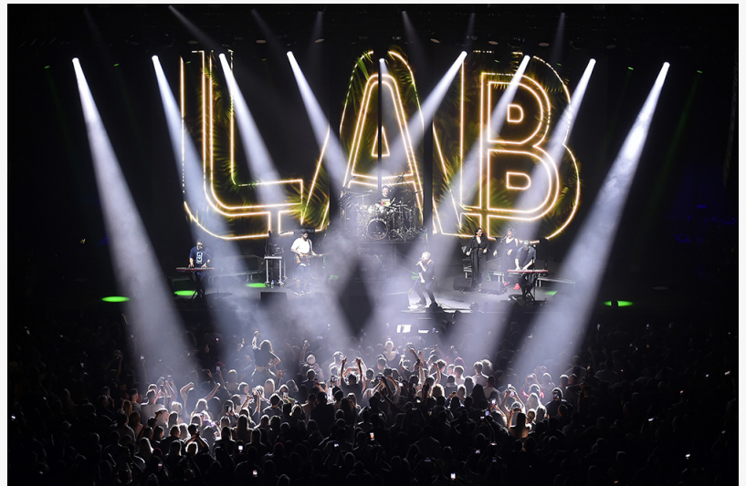
L.A.B Live Show

L.A.B recently won Best Record at NZ RollingStone Awards 2022 for their album L.A.B V.