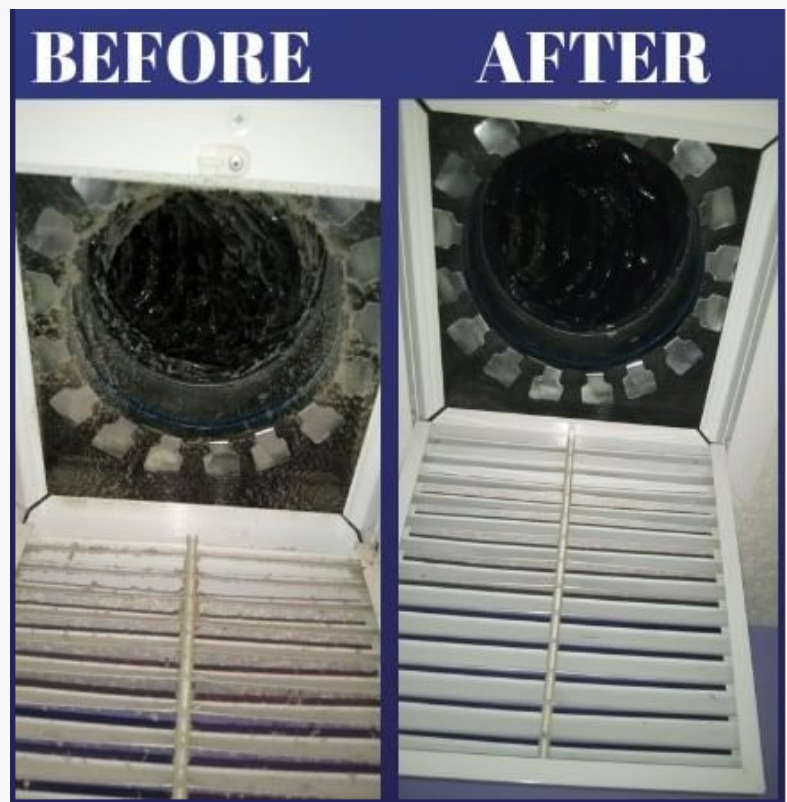
Mold in AC Vents