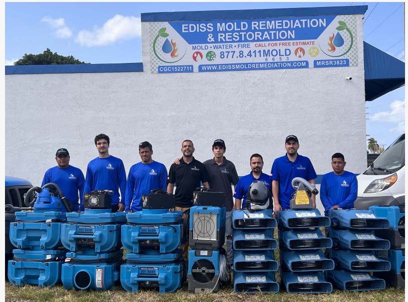
Ediss Mold Remediation Team 2022

The problem may be in the home. Mold can cause a myriad of problems from damaging the home to making the occupants sick. But how does one know if mold is present?