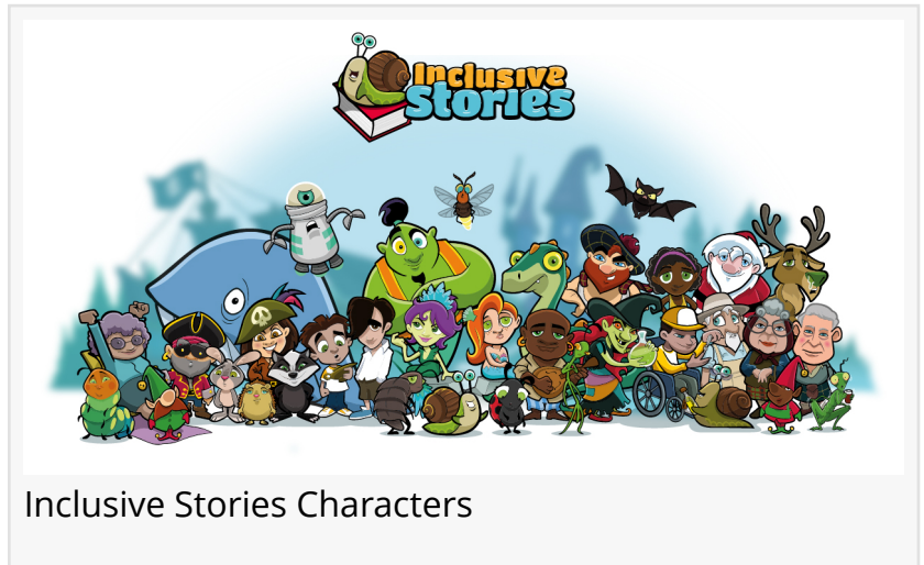
Inclusive Stories Characters

/EINPresswire.com/ -- HelpKidzLearn , award-winning creators of accessible software used in tens of thousands of special educational needs schools and establishments worldwide, brings to the market fun, engaging, interactive sensory stories and resources, specially designed to focus on a range of learning intentions, developmental areas, and topics relevant for learners with a wide range of educational needs.