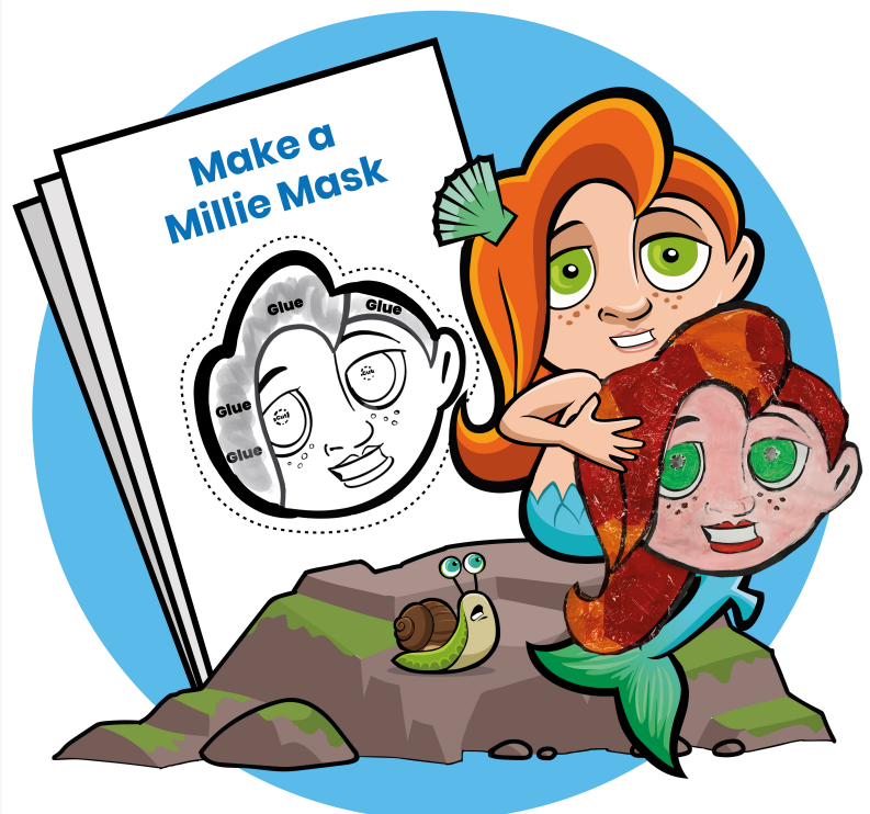
Inclusive Stories Resources