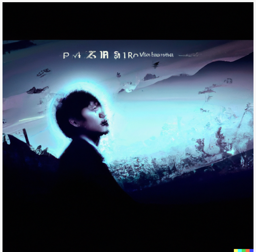
World of AI banner, generated using DALL-E 2

The images, which can range from photorealistic imagery to oil paintings in the style of Vincent