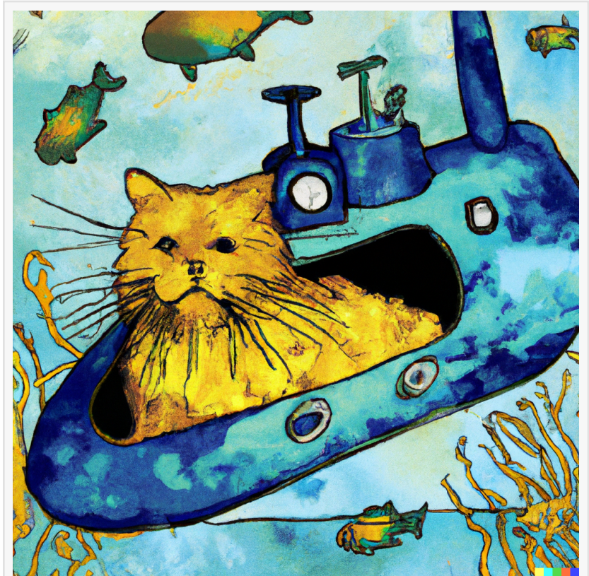
Image generated by DALL-E 2: "Image of a cat in a submarine in the style of Vincent van Gogh"

This press release can be viewed online at: https://www.einpresswire.com/article/589409635