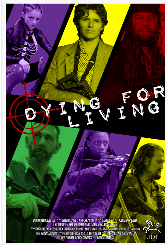
Dying for Living Poster 3