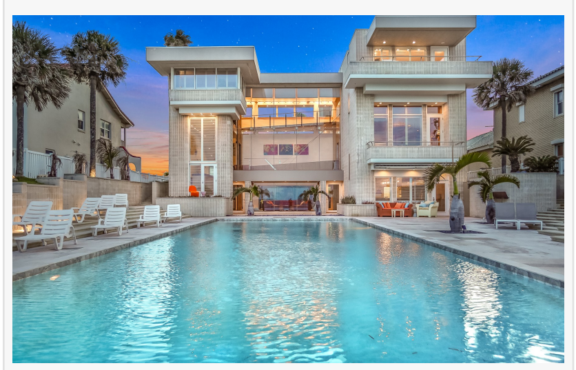
489 Ocean Shore Blvd Ormond Beach Florida - William Morgan Design - Reflecting Pool with Cascades: 63-foot three-lane infinity pool is framed by water cascades, bottle palms and private access to the beach. Water flowing from top of the cascades also "off

Grand Pavilion: Created for entertaining, the views are of the magnificent reflecting pool and the ocean. A second glass wall allows a private entrance to a hidden Japanese Zen Garden with a