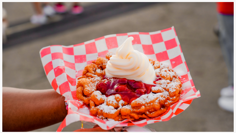
Enjoying a funnel cake at the Thrillville Fair

Friday - Sunday Unlimited Ride Armbands - $35