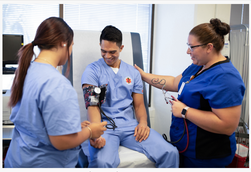
HMC Instructor with Students

Currently, <u>Hawaii Medical College</u> <u>programs</u> include Clinical Medical Assistant, Healthcare Administration Billing & Coding, and Advanced Nurse Aide. Diploma level programs can be completed in 15 months, while Degree Programs take 24 months. Students