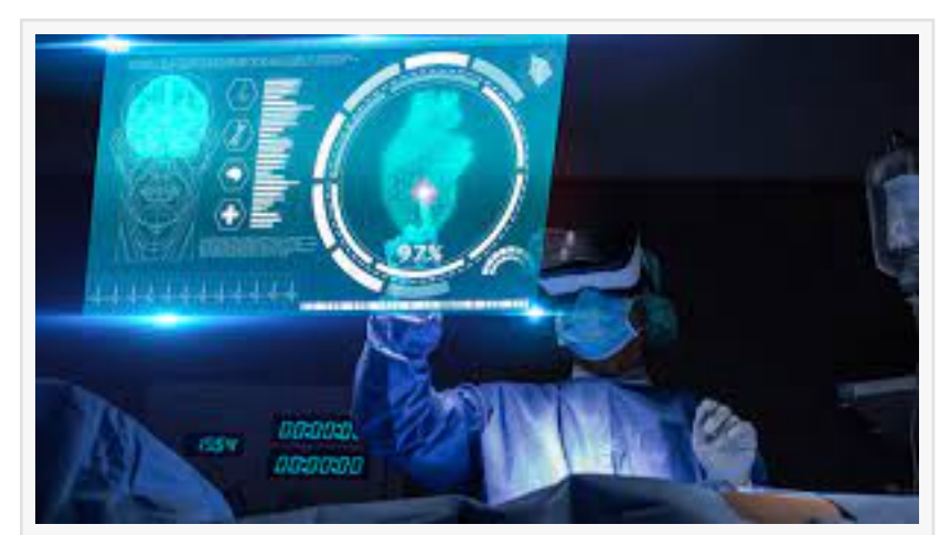
Healthcare in Metaverse Market Strategies [+Sales Growth], Factors and Forecast 2031

NEW YORK CITY, NEW YORK, UNITED STATES, September 7, 2022 /EINPresswire.com/ -- The healthcare industry is preparing for a new era of competition as the first Metaverse marketplaces open for business. These virtual reality platforms offer a new way for companies to advertise and sell their products and services, and