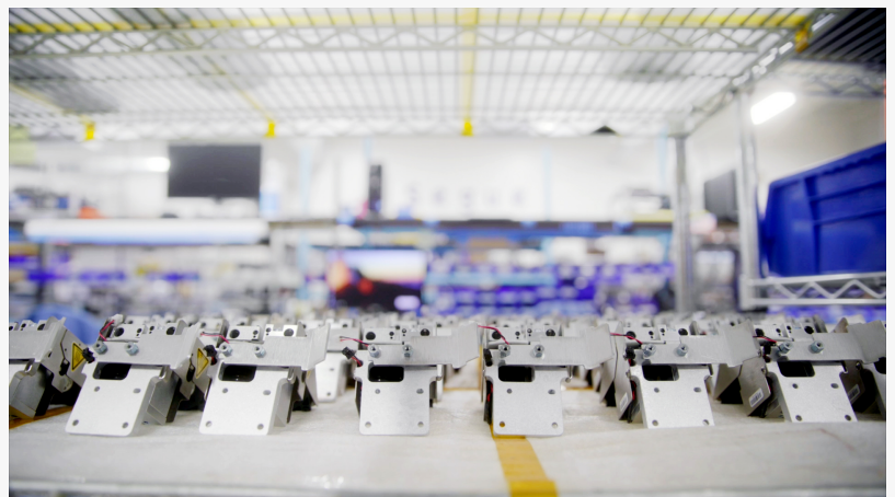
Segue Manufacturing Services Boston Operations Center, Medical Specialists

One of the premier events in the Biomedical and Medical Device industry, BIOMEDevice Boston will showcase thought leaders, emerging technology, and global medical and tech trends in its anticipated return on September 28-29 at the Boston Convention & Exhibition Center.