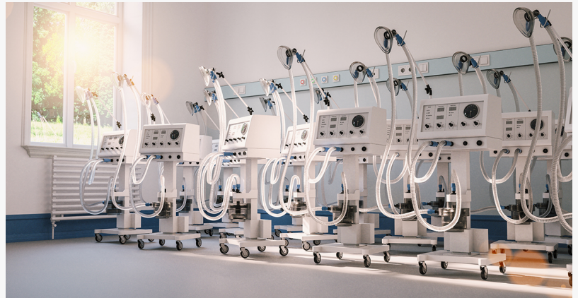
Segue Manufacturing - Medical Device Expertise

At BIOMEDevice Boston, Segue Manufacturing Services will be exhibiting its latest capabilities in complex Medical Device manufacturing and engineering services, including regulatory solutions for OEMs that must comply with the USA Food and Drug Administration (FDA) requirements for Class I, Class II and Class III devices.