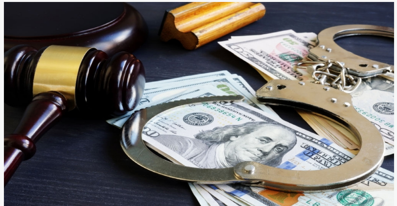
Liberty Bail Bonds

In the USA, bail bond companies are making USD 14 billion in turnovers per year. The bail bond company or agent helps with the bail amount and assists with the paperwork in the bail process. The bail bond business is regarded as a surety business that helps individuals avoid going behind bars by supporting them to satisfy their capital needs to remain out of jail. A bail bond company typically charges around 10 percent of the bail amount for their assistance. To induce the accused to return for the court trials, the bail bond company enters into a contract with the accused person's family. The company may ask for collateral such as a house or other property to put as a requirement to meet the contract requirement.