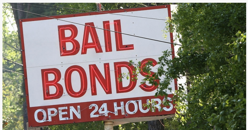
Bail Bonds Service in Haltom City

The agent will walk you through different bail bond options. The bail agent agrees to guarantee the release of the accused in exchange for a reconciled fee. Once the fee has been bargained, and the arrested person or co-signer settles and takes responsibility for the bail bond's face amount, the bail agent submits the bond to the jail, and the accused is released from custody.