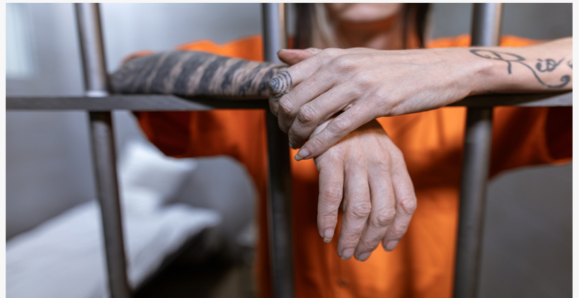
Bail Bonds Haltom City