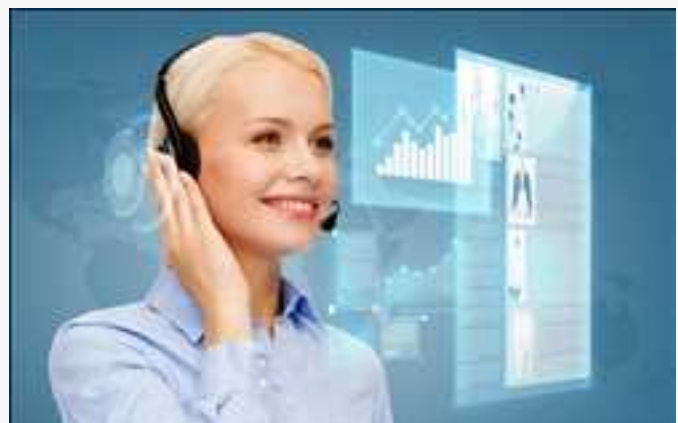
Global Healthcare Virtual Assistants Market