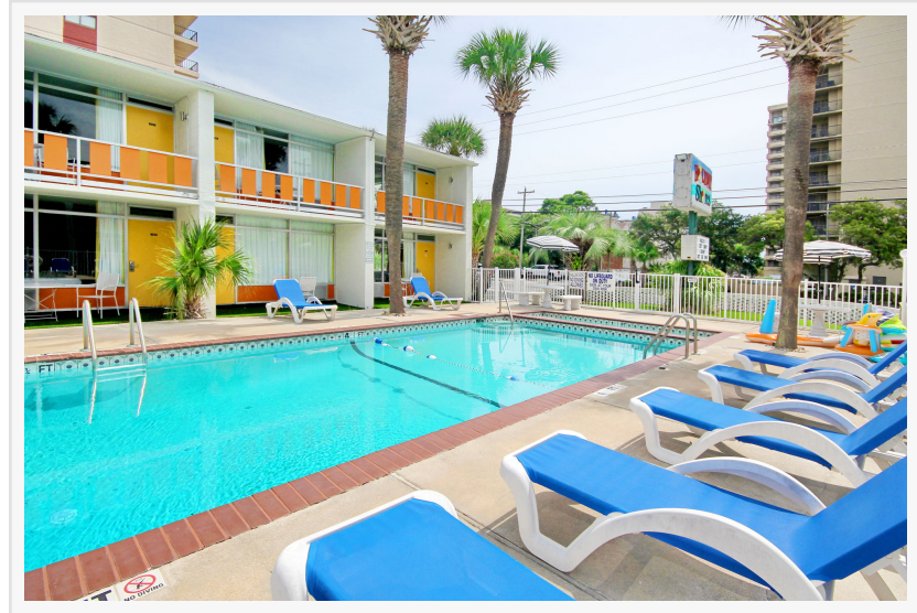
Myrtle Beach Retro Hotel Poolside View

Katherine McDermid Airriva +1 614-313-7342 email us here