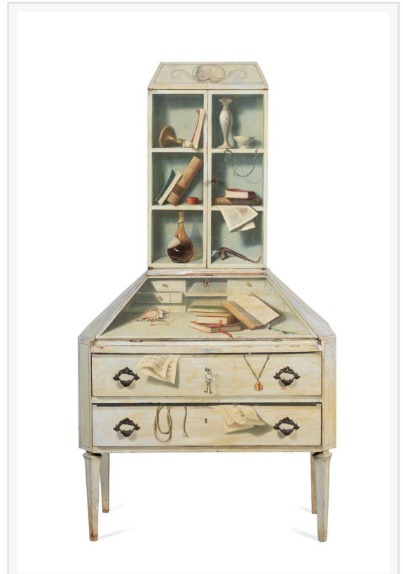
Mid-century Italian trompe l'oeil painted secretary bookcase in the style of Eugene Berman and Fernand Renard, 73 inches by 39 ½ inches ($15,000).

This press release can be viewed online at: https://www.einpresswire.com/article/590003557