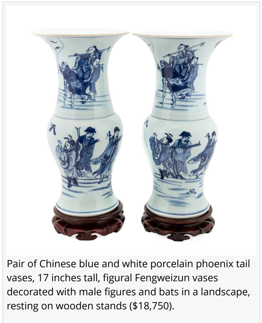
Pair of Chinese blue and white porcelain phoenix tail vases, 17 inches tall, figural Fengweizun vases decorated with male figures and bats in a landscape, resting on wooden stands ($18,750).

Elizabeth Rickenbaker Ahlers & Ogletree Auction Gallery +1 404-869-2478 email us here