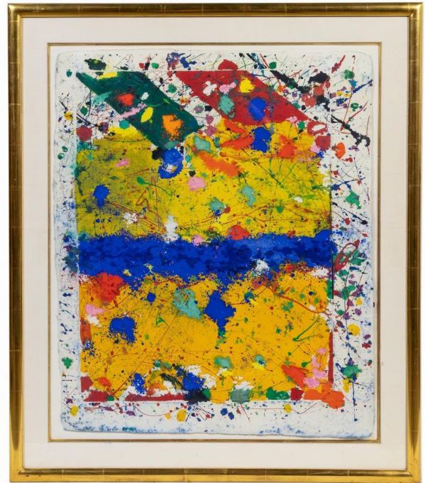
Untitled paint splatter work by Sam Francis (Calif., 1923-1994), one of two Sam Francis paint splatter paintings in the auction. Untitled SF 78 was signed by Francis lower right ($18,750).