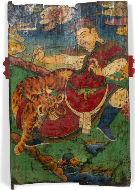
Tibetan polychrome painted wood door depicting a guardian spirit with a tiger on a chain in a celestial landscape, 58 ½ inches by 40 inches, attached to a red painted wood frame ($17,500).

The second was an untitled paint splatter work by Sam Francis (Calif., 1923-1994), one of two Sam Francis paint splatter paintings in the auction. Untitled SF 78 was an abstract monotype acrylic and mixed media on laid paper, with geometric shapes and yellow stripes. The painting was signed by Francis lower right and housed in a frame measuring 37 ¾ inches by 32 ½ inches.