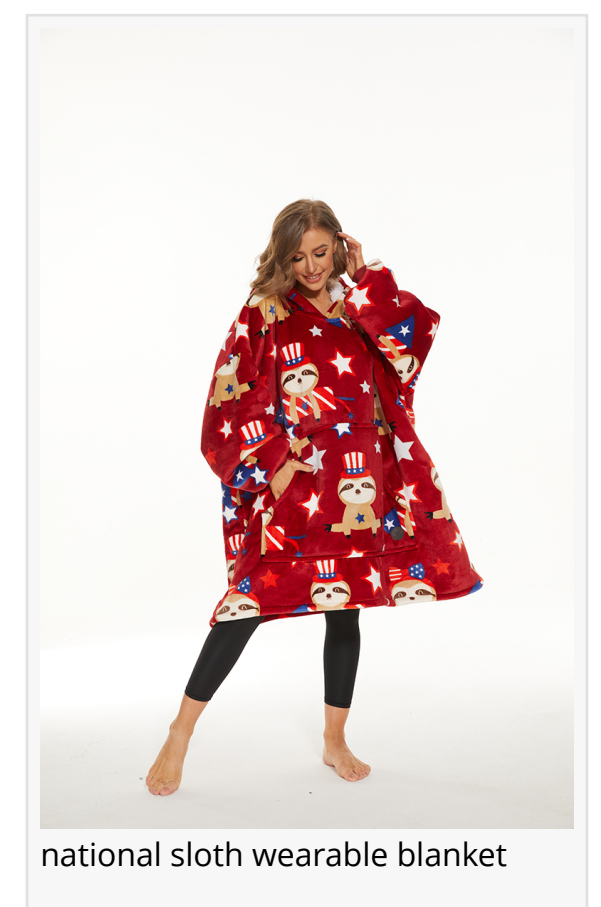
Red is the theme color of this wearable blanket. Red is one of the elements belonging to the American flag. It represents enthusiasm, unrestrainedness, joy, and celebration. Westerners usually use red to show their respect when welcoming distinguished guests. For example, when participating in some communion ceremonies, they will wear red clothing to show holy love. Also, red symbolizes perseverance.

and different color stars. Wearable sweatshirts with the elements of the American flag prominently displayed are a stylish way to show your pride. This wearable blanket would be appropriate for celebrating Independence Day, taking part in some American theme parties, etc.