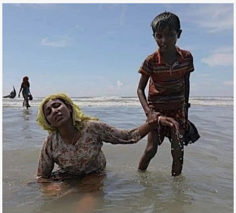
Sindh as worst hit are facing unprecedented catastrophic flood

WASHINGTON, DISTRICT OF COLUMBIA, UNITED STATES, September 9, 2022 /EINPresswire.com/ -- A week-long Sindh Hunger Strike against human rights abuses and man-made catastrophe of floods in Sindh under Pakistan, in front of the United Nations Head Quarters during its 77th General Assembly Session is to be begun from September 13th. Professor Noam Chomsky, America’s world-renowned Cognitive Scientist, philosopher, linguist, and social and political critic has supported the Sindh Hunger Strike across the UN. He is also among the signatories to the petition for the rights of Sindh.