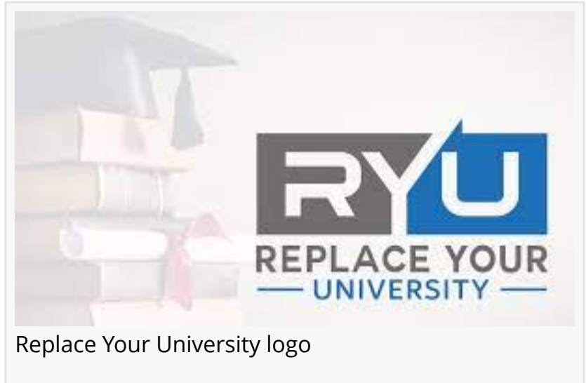
Replace Your University logo

successful in real estate investing by assembling a dream team of expert investors to help clients learn the process. With this new program, the company has built an even more collaborative and engaging work environment.