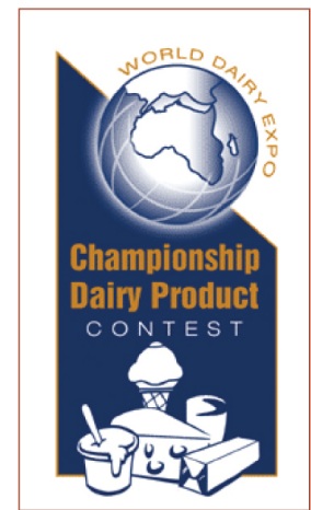
Grand Champion French Onion Dip

The 2022 World Dairy Expo Championship Dairy Product Contest received a record 1,560 entries for cheese, butter, fluid milk, yogurt, cottage cheese, ice cream, sour cream, sherbet, cultured milk, sour cream dips, whipping cream, whey, and creative/innovative products from dairy processors throughout North America.